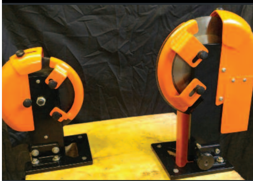
FLESHING MACHINES 10" & 12" MODELS